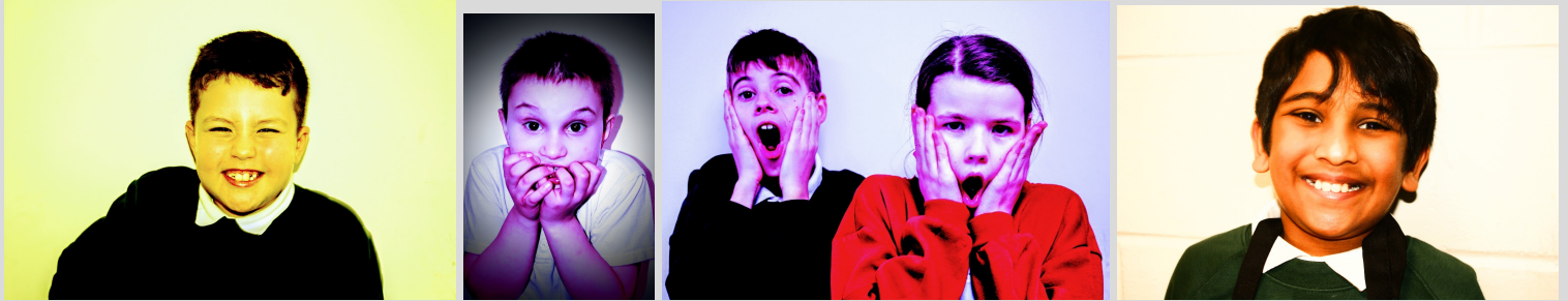
Recent images from an assembly on mindfulness and different emotions!